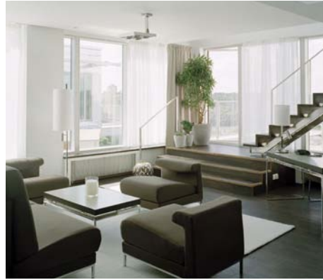
Clarion Hotel Stockholm