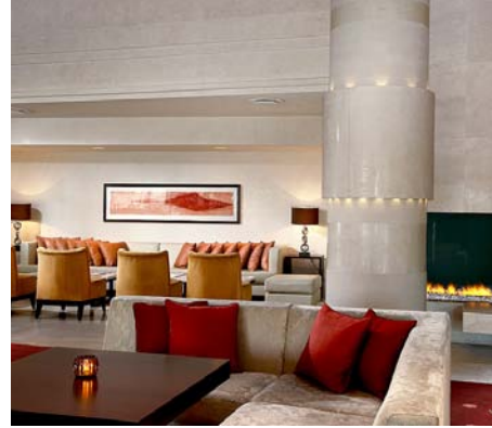
Sheraton Hotel Stockholm