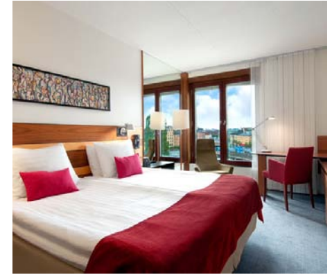
Hilton Stockholm Slussen

At gay-managed Hotel Skeppsholmen , a slick, serene renovation turns two 17th-century naval barracks into an amenity-laden island of culture and calm, literally. Ensclosed in nature next to the Modern Art and Architecture Museums, its central waterfront location is a captivating choice for a discerning crowd. Condé Nast Traveler agrees: it's the only Scandinavian hotel listed on its 2010 Hot List!