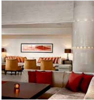
Sheraton Hotel Stockholm