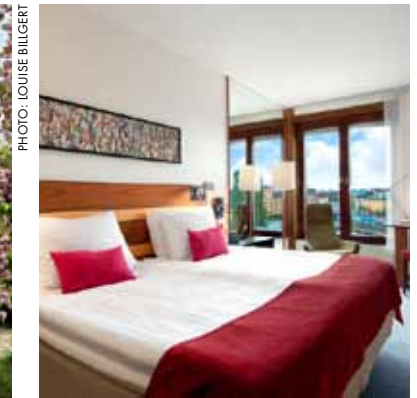
Hilton Stockholm Slussen

At the just-renovated Sheraton Hotel Stockholm , five-star service and a popular happy hour mere steps from the train station draw a choice crowd to the central business district. From individually decorated rooms to meals in a exquisite conservatory, Hotel Hellsten is a gem prized for its impeccable good taste, buffed daily with a sheen of cozy charm.