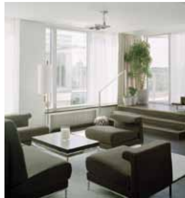
Clarion Hotel Stockholm